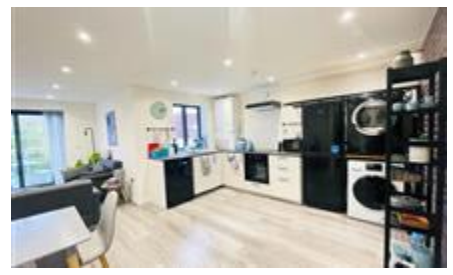
Arendale Court, Hendon Way, London £2,200 pcm