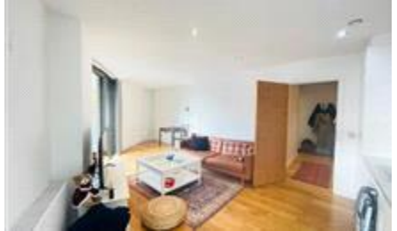
Gateway House, Regents Park Road, London £1,900 pcm