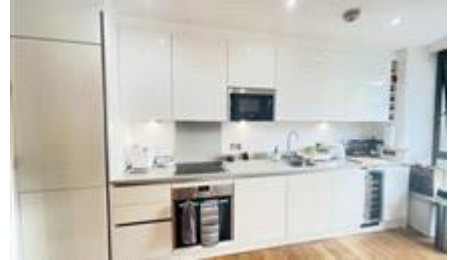
*SUPERB LOCATION* *AVAILABLE 16TH DECEMBER*